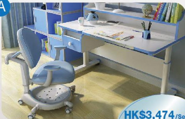
Set A: KD15 desk + K15 chair