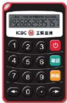
ICBC Asia Token