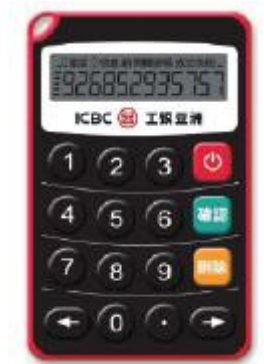
ICBC Asia Token Sample