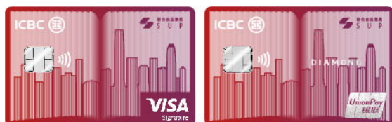
ICBC SUP Credit Card

ICBC credit card customers can enjoy the InCredible Rewards*! Spend with your ICBC Credit Card at the following merchants to enjoy discounts and instant discounts, up to HK$300 off !